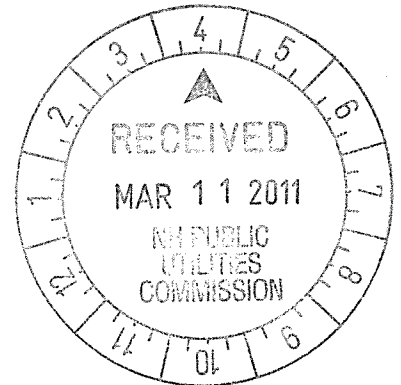
Exhibit RSF-1: Testimony of Robert S. Furino

Cover Letter Petition Motion for Confidentiality and Protective Order Certificate of Service Proposed Tariffs